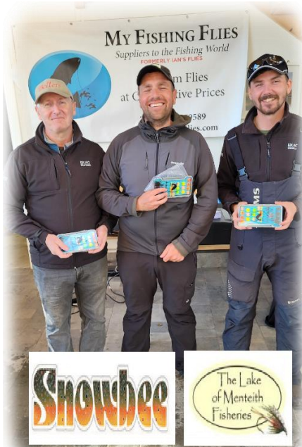
East Kilbride AC "A"