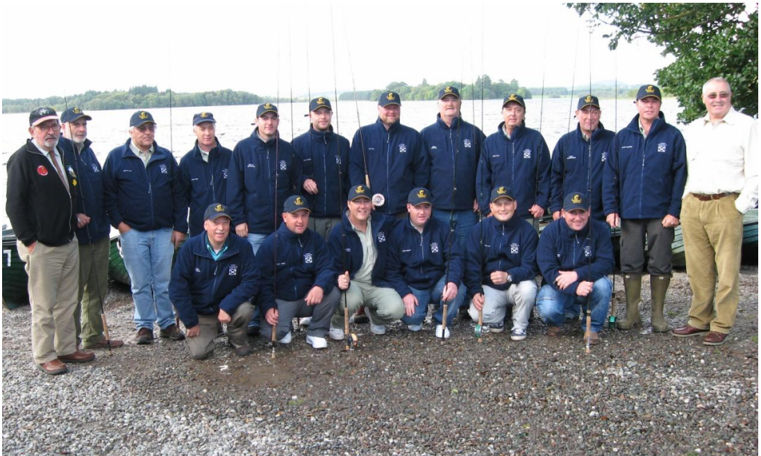
Scottish International Team successful at the 2009 Autumn International at the Lake of Menteith